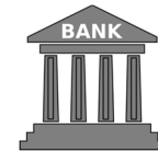
AT THE BANK.