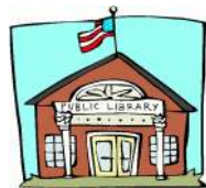
TO THE LIBRARY.