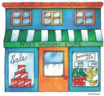
TO THE GROCERY STORE.