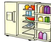
IN THE REFRIGERATOR.