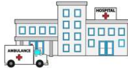
TO THE HOSPITAL.