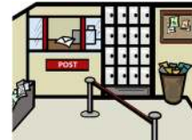
TO THE POST OFFICE.